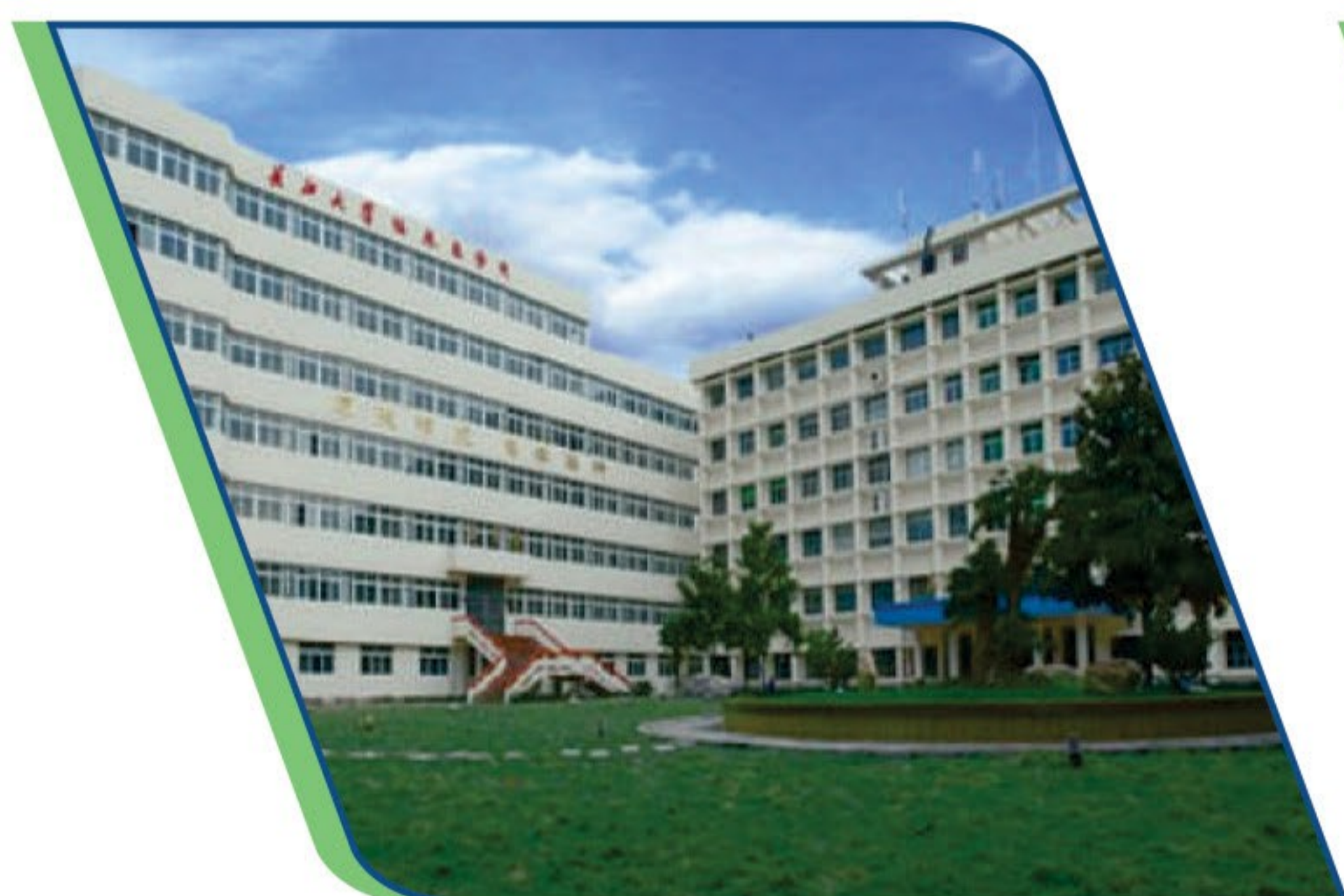
Yangtze University Hospital (2500 Beds)

UNIVERSITY IS LOCATED IN JINGZHOU CITY, HUBEI PROVINCE CHINA.