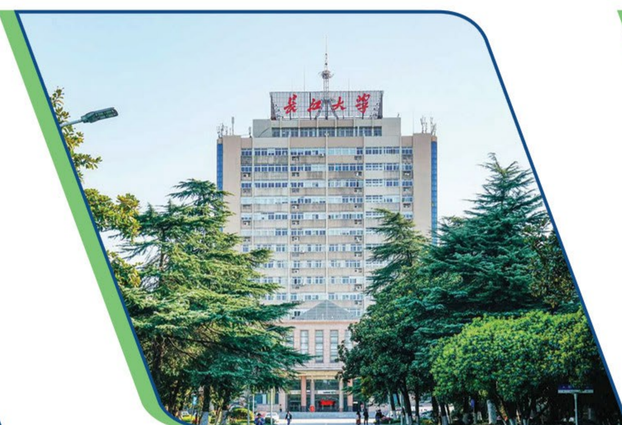
Main Teaching Building