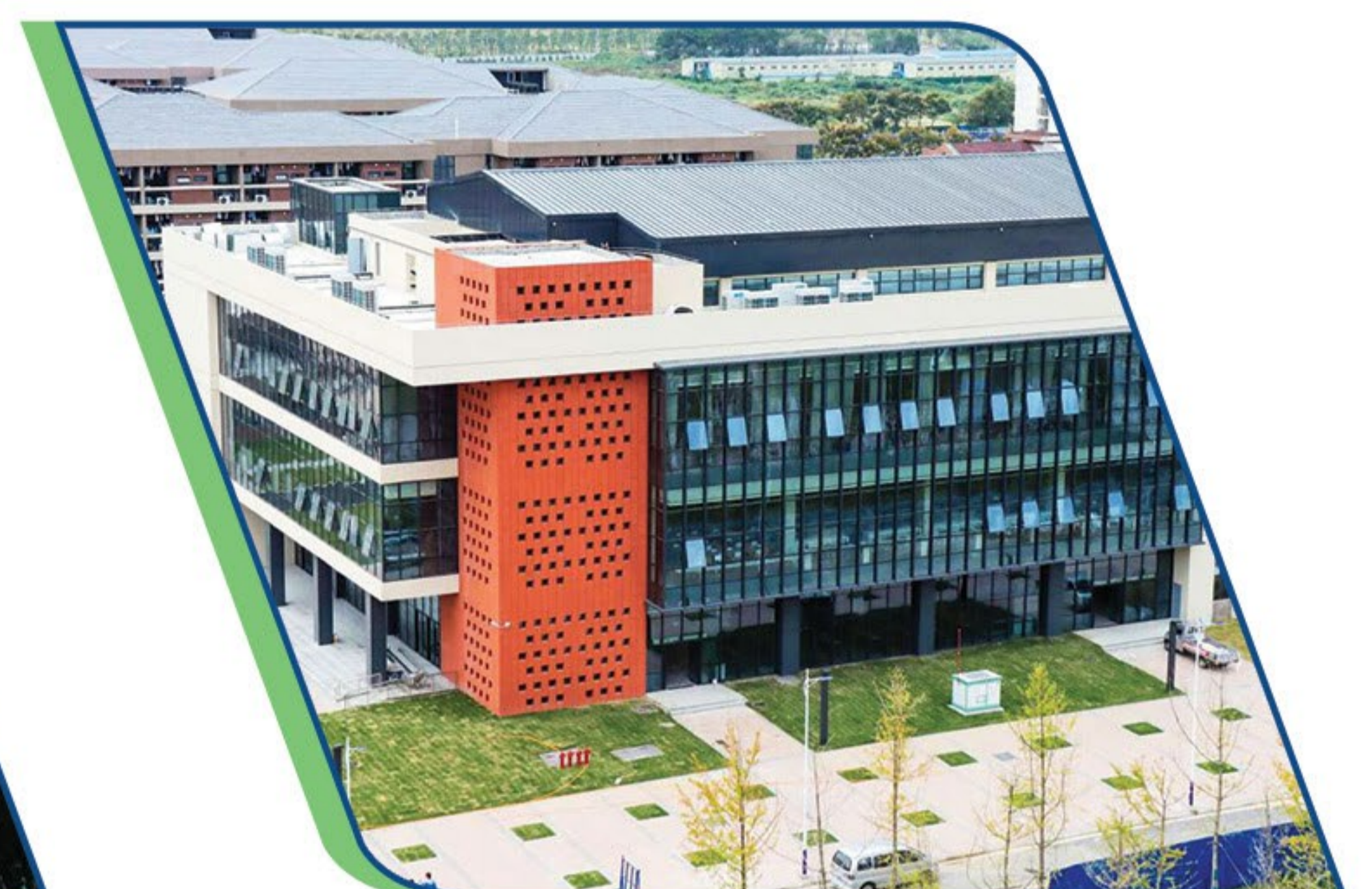
Yangtze Teaching Building