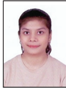
Celeste Yousaf Hyderabad